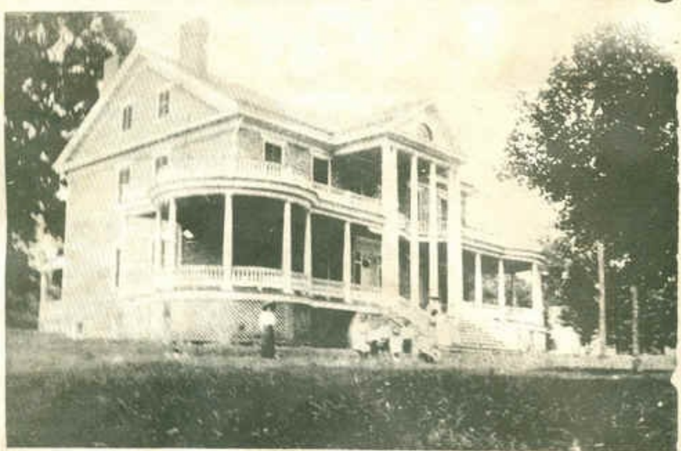
THE HOLSTON SPRINGS OF RUFUS AYERS