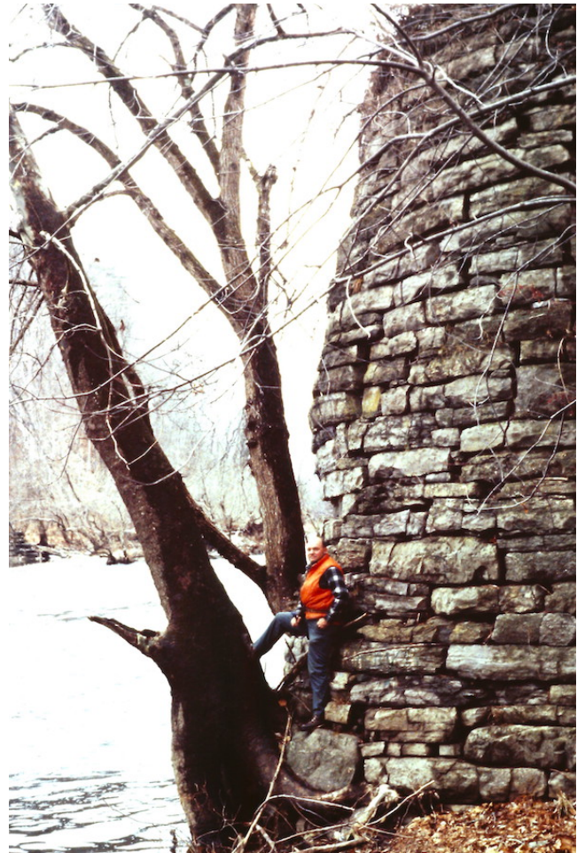
THE AUTHOR AND THE RETAINING WALL OF THE UN- FINISHED LOCK BETWEEN BUCH- ANAN & EAGLE ROCK

After the Civil War Virginia found itself in an economic quandary. Its tax base was in rubble. A third of the territory of the Commonwealth had been turned by the Federal Army into West Virginia, taking that tax base with it. Virginia did not have the tax revenue to pay off the canal bonds at face value, and to simultaneously pay for a public school system. The bonds had been originally bought by loyal Confederate Virginians, who after the war had sold them to