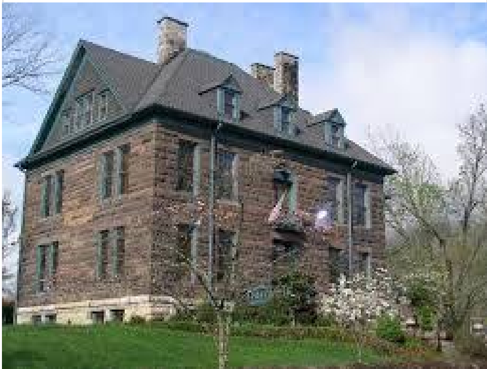
THE AYERS MANSION ON POPLAR HILL IN BIG STONE GAP; NOW THE SOUTHWEST VIRGINIA MUSEUM AND HISTORICAL STATE PARK